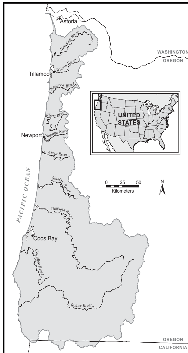
Figure 1. Oregon coastal watersheds considered in this study.